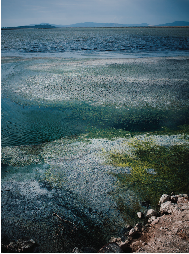
Figure 3. Homa Lagoon: In the wetland, water is always multiple.

Turkish environmental NGOs began to take an interest in the wetlands, advocating for their conservation and filing lawsuits against new construction within the protected areas. These groups, however, staked competing claims on the changing ecological infrastructures of the delta, as I will describe in the next section.