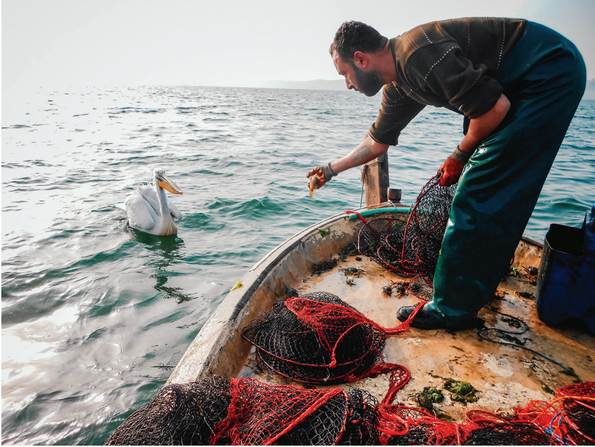
Figure 4. Fisherman shares the day's catch with a pelican.

ployees. Much as fish are trapped in the mobile infrastructure of the lagoon seeking warmth and food, Erdal told me en route to the train station after a fishing outing, so, too, had he felt trapped in his factory job. Extending Erdal's comparison, both fish and fishermen were caught in yet another trap: the changing infrastructural bureaucracy of the lagoon.