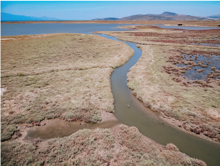
Figure 2. Salicornia , salt marshes, and fishing huts in the conservation area.

As pumps and canals irrigated the wetland, the lower delta’s water was being redirected to sites of water-intensive industrial and agricultural production, which, in turn, released agricultural and industrial pollutants. Moving flows of water and sediments thus simultaneously produced, sustained, and endangered the delta. Siki’s vision of a wetland’s moral ecology was predicated on infrastructural