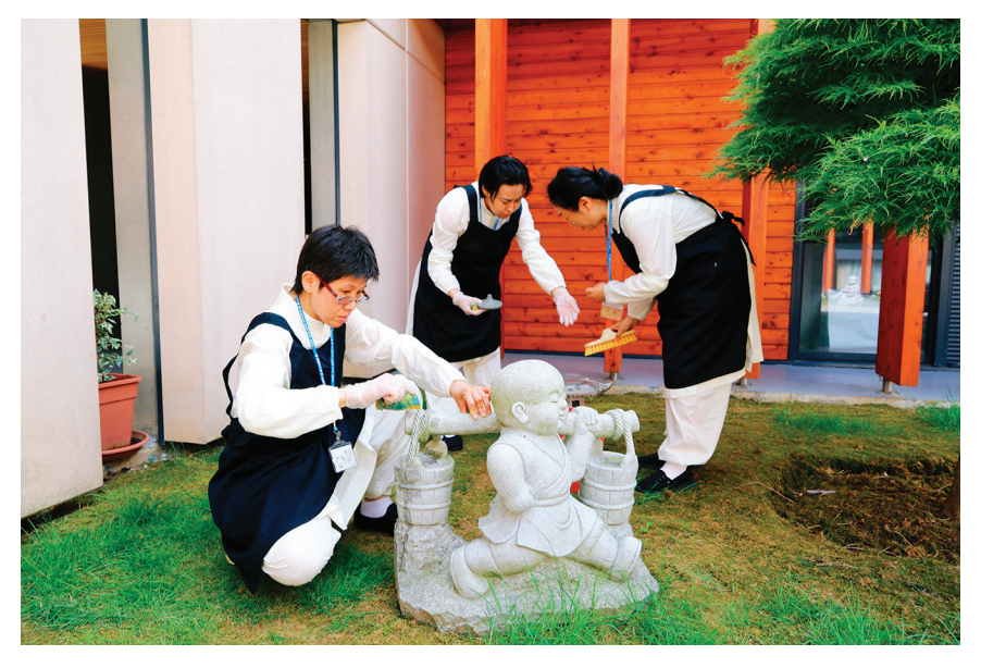
Figure 7. Preceptees carry out chores, carefully cleaning a Buddha statue and other garden ornaments at the Fo Guang Shan European Headquarters, Fahua Temple, Bussy-Saint-Georges, near Paris, 2018.

And neither is it the case, as Robbins's interpretation of ritual as transcendence might suggest, that this religiously inspired ethical pedagogy proceeds principally through an experience in ritual of perfected ideals, that is, through an (albeit fleeting) attempt to manifest the transcendent, "realizing one or a few values very fully" (Robbins 2015, 28). If that were the aim, the retreat would be constructed differently. As in much liturgical ritual, mistakes and missteps would be simply ignored, with only the successful completion of prescribed actions acknowledged as having occurred at all (Humphrey and Laidlaw 1994; Seligman et al. 2008). Instead, the conditions are such that chronic, repeated failure becomes inevitable and salient.