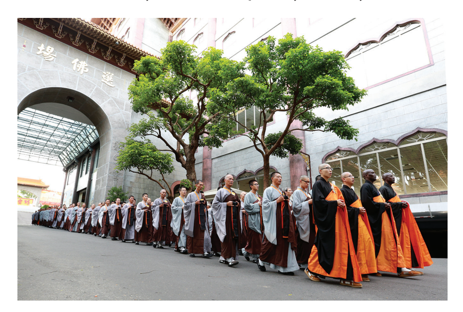
Figure 5. Preceptees walk in formation behind their guiding venerables. They are wearing the jiasha robe, holding the sitting mat before them, and carrying the alms bowl in a bag worn over the shoulder. Fo Guang Shan Headquarters, 2016.

Internal monitoring means focusing on the mind to identify and try to remove afflictions (煩惱; fannao), especially greed (執著; zhizhuo) and the spirit of comparison (比較; bijiao). Monastics frequently emphasize that this internal renunciation with the mind (心出家; xin chujia) is as important as the external renunciation with the body (身出家; shen chujia). They are causally linked because