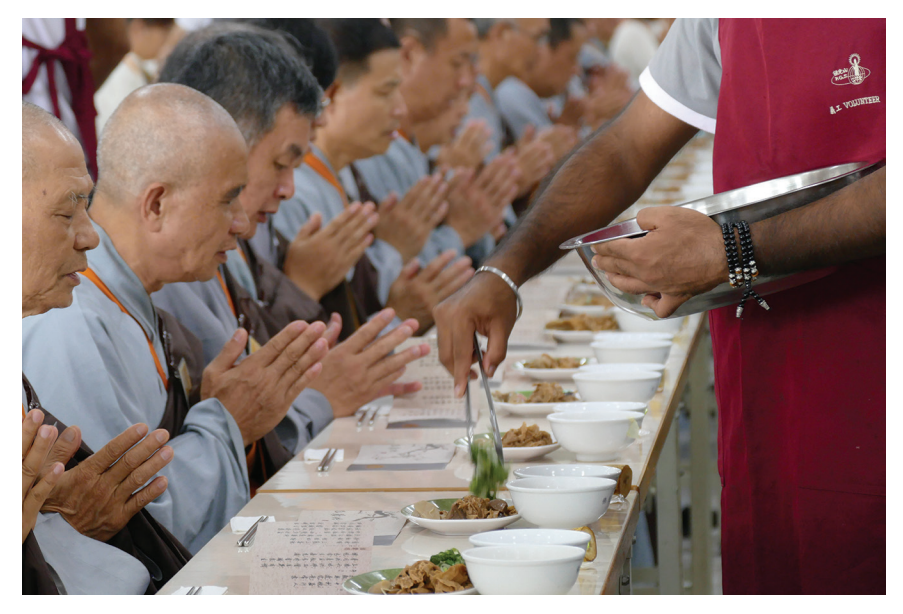
Figure 6. Preceptees eat together during the retreat at Fo Guang Shan Headquarters, 2016.

The lessons to be drawn from individuals' mistakes are transmitted to the whole retreat during meals and lectures, with presiding venerables recounting, "One person did such and such, and the reasons why this is wrong are thus and so. You should all avoid this mistake." Such public criticism is always anonymized, and the correction of individuals, while sharp and direct, is also done discreetly; if verbalized, it is usually directed at a whole group. Further discreet correction is provided by each group's guiding venerable in written feedback on the daily diaries participants are required to write, recording their thoughts and feelings.