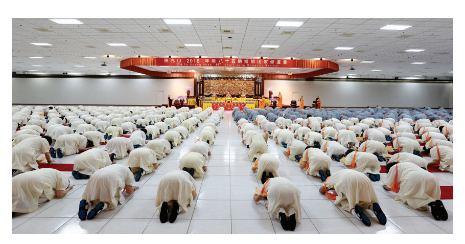
Figure 1. Preceptees prostrate in the main shrine room at Fo Guang Shan Headquarters, Kaohsiung, Taiwan, 2016.

Understanding how this process works not only provides insight into this influential form of Buddhism but also proves instructive for anthropologists seeking to understand the ways in which people strive to live well—that is, ethics, broadly understood. Over the past couple of decades, many anthropologists have come to