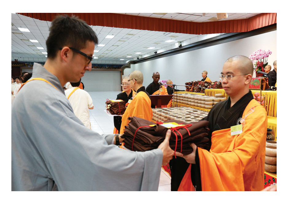
Figure 3. New preceptees are given robes, alms bowls, and sitting mats at the conferring the precepts ritual, Fo Guang Shan Headquarters, 2016.

By lunchtime on the first day, participants have arrived, registered, and moved into their dormitories. They pay a modest fee (and many also make voluntary donations),¹ and they receive an information pack and clothes. Men receive two pairs of cotton trousers, two long cotton tunics (中掛; zhonggua), and two sets of thick cotton stockings, worn with garters. Each participant also receives an apron and sleeve coverings for chores, and a set of more sacred items. The first of these is the haiqing (海青), a high-collared, ankle-length, gray-blue tunic with capacious sleeves that serve as pockets. The haiqing is worn at all times outside one's dormitory except for physical work and walking meditation, and it must be removed and folded correctly before entering a bathroom. Then there is the ju (吳), a colored cloth used as a liturgical sitting mat, and a small bag with a shoulder strap used for carrying an alms bowl. Men receive a jiasha (袈裟), a long