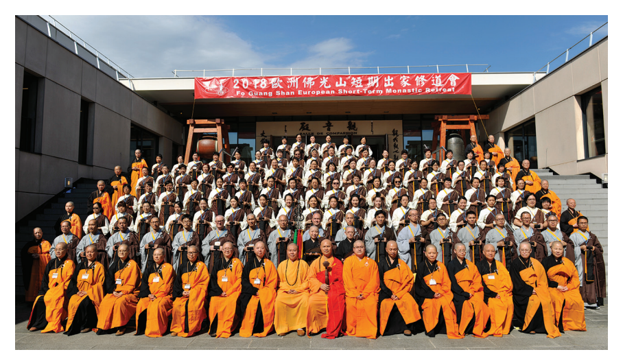
Figure 8. Preceptees and monastics pose for a group photo after the conferring the precepts ritual, Fo Guang Shan European Headquarters, 2018.

Many participants claimed lasting changes in their everyday life—if not becoming fully vegetarian, then moving in that direction, or reducing alcohol consumption, or refraining from killing insects. Others reported more dramatic changes. One young Singaporean woman went home, packed four boxes of clothes and shoes to give to the Salvation Army, and quit her job with an airline. After volunteering at a temple in the Philippines for some time, she started a new career as a charity fundraiser. "Oh," she added, "and I gave up drinking coffee." Others found they were unable to sustain the self-improvement they felt during the retreat for very long afterward, and some of those used imagery of needing to be "recharged." Perhaps thinking back to the retreat and how one felt then might help? Others concluded that they had to undergo it again.