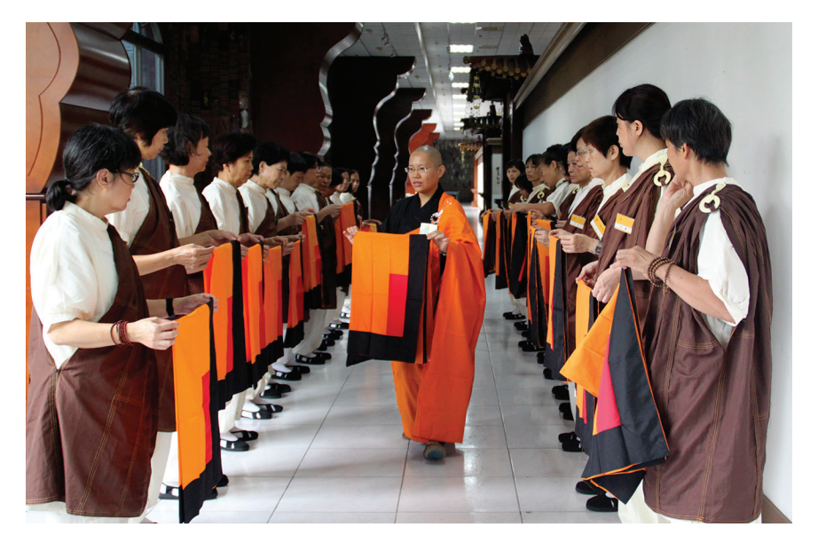
Figure 4. A guiding venerable shows a class of new preceptees how to fold the sitting mat, Fo Guang Shan Headquarters, 2016.

Returning to their dormitories before breakfast, ordinands are issued with a new monastic name, which is used from now on and replaces their lay name on their lanyards. This day continues with more training and rehearsal, as well as lectures on the meaning of the Precepts, and ends with a lengthy rite of repentance, with many prostrations that leave ordinands sweating and exhausted but spiritually ready on the third morning for the last of the four opening ceremonies, conferring the Precepts (傳受戒; chuanshoujie).