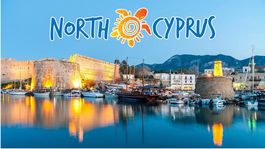
Figure 8. Touristic disavowal.

became satisfied with, for instance, calling their entity “north Cyprus” rather than “TRNC” in tourism advertising. The retired teacher’s surprise at Google Maps’ use of TRNC to label north Cyprus is only one example of Turkish Cypriots’ implicit knowledge that certain options are foreclosed for them.