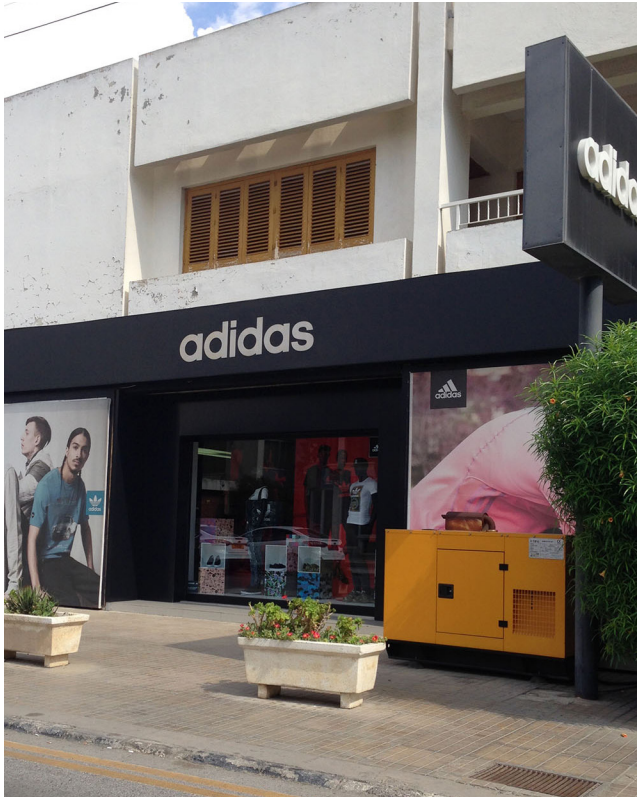
Figure 4. The “real” thing: A shop on Dereboyu, the main shopping street outside the walls in north Nicosia.

I remarked that I was not so sure about the lasting power of Converse in general as a brand, but I also was struck by the young woman’s logic, which in fact I had heard only about an hour earlier while shopping in a brand-name shoe store in the south. In that store, two Turkish Cypriot women had been conversing while the husband of one tried on shoes. “We have Clarks and brands like that,” said one, referring to shoe stores in the north, “but they’re just not comfortable. Clarks are supposed to be comfortable, but these never are. I don’t believe they’re the real thing.”