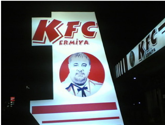
Figure 6. Kermiya Fried Chicken, also now defunct, named after a neighborhood of north Nicosia.