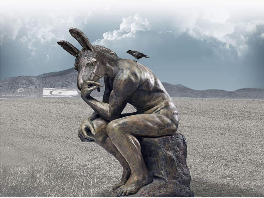
Figure 10. The donkey as symbol of the melancholic Cypriot.

international community. As a “strategy for a situation,” the parody and campiness that currently pervade Turkish Cypriots’ approaches to their state appear as “the community-building survivalist dealing with the signs of a stigmatized . . . identity” (Cleto 1999, 90; emphasis original)—or in this case, a stigmatized “state.” As Richard Dyer (2002, 49) put it, “It’s being so camp as keeps us going.”