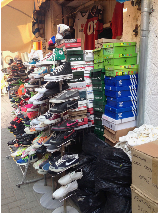
Figure 3. Labels and “labels.”

ists, students, and laborers. And as I will explain, in the early 2000s global capital for the first time made its mark in the north in the form of new shopping malls and high-end shops and cafés.