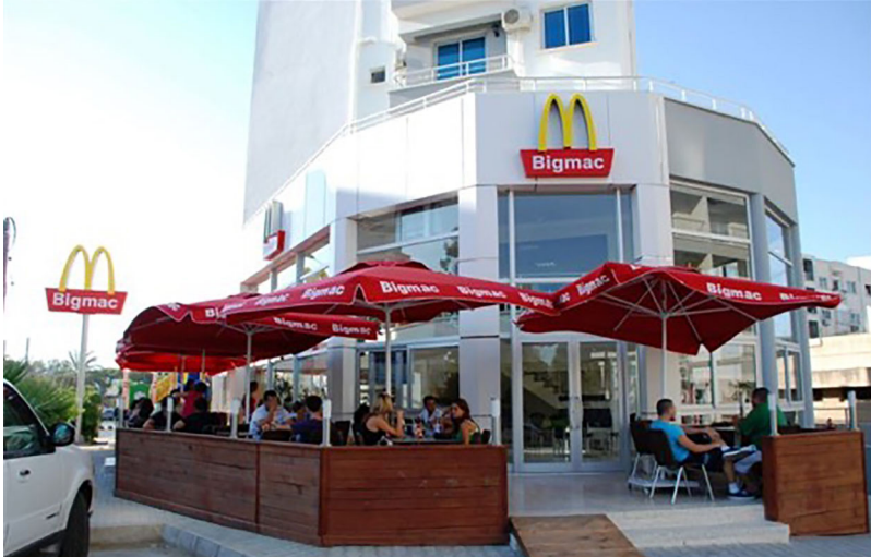
Figure 5. Signs of simulation: The now defunct Big Mac in Nicosia.

brand-names to be bought—except in their pirated versions. The north’s status as a “pirate state” was visually and viscerally reflected in the way that in every realm of life they were faking it. In place of McDonald’s you found Big Mac, in place of Pizza Hut you had Pizza Hat, in place of Kentucky Fried Chicken there was Kermiya Fried Chicken—Kermiya being a neighborhood of north Nicosia. They used similar designs, packaging, and recipes to the original, but they were fakes. And obvious ones. 4