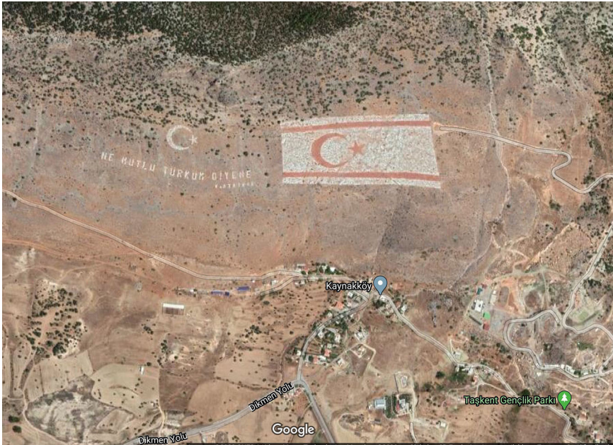
Figure 9. Google also loves the TRNC flag. Map data: Google, Maxar Technologies.

ognition complex, he suggested that it “fails even as it succeeds and succeeds even as it fails” (Bryant and Hatay 2020, 158).