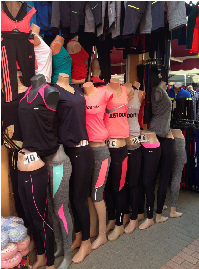
Figure 2. Some of the assortment of “brands” available in the island’s north.

“Yes,” this young woman clarified for me, “they’re made in Turkey, but in different factories.” I nodded, and just to be polite asked if I might try on a pair of “Nikes.” She ushered me into the shop, stacked high with pirated items.