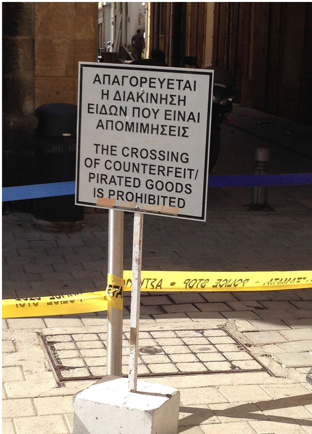
Figure 1. A sign at the Ledra Street checkpoint prohibiting the crossing of counterfeit goods into Nicosia's south.