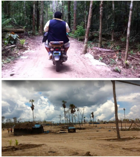
Figure 7. Into the rain forest and in the mines.

forms into the coca plant. The story's takeaway: Kuka, now Mama Coca, won't rest until her people are free, poisoning those who colonize them and their lands. Kuka's leaves nourish the descendants of her people—high in essential nutrients and vitamins when chewed or taken as tea. But as cocaine, she is toxic.