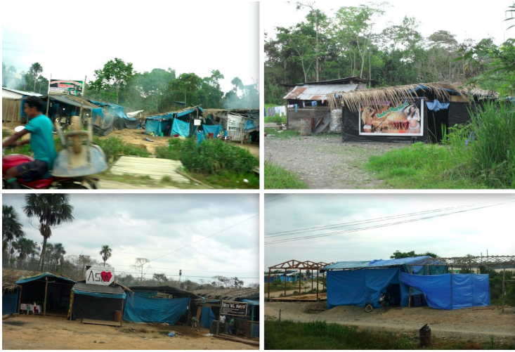
Figure 1. Life by the side of the highway.

ically. His companions nodding assent, another engineer adds: “It’s all because of the highway.”