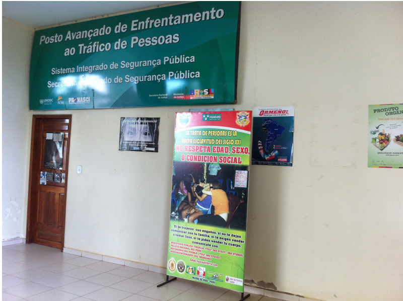
Figure 6. Brazil-Peru Border: Public Safety and Military Post to Confront Human Trafficking and Biological Materials.

Guards most often confiscated coca at the border crossings, a result of an overall crackdown on cocaine. Yet the plant was popular because it kept miners and sex workers alert during long hours, not to mention its purported circulatory effects for erection issues. When I asked Brazilian border agents about the hard line on coca (even coca candies were banned), they responded: “Mules carry more than the leaf.” Women acting as carriers, so-called mules ( mulas )—another instance of gendered interspecies collapse—commonly serve as human vehicles for trafficking cocaine (Kernaghan 2015) and wildlife. Border authorities now receive training to recognize traits of traffickers to help catch these mulas . Mulas , the agent explained, can traffic drugs, gold, or other women—and they might also be the commodity trafficked.