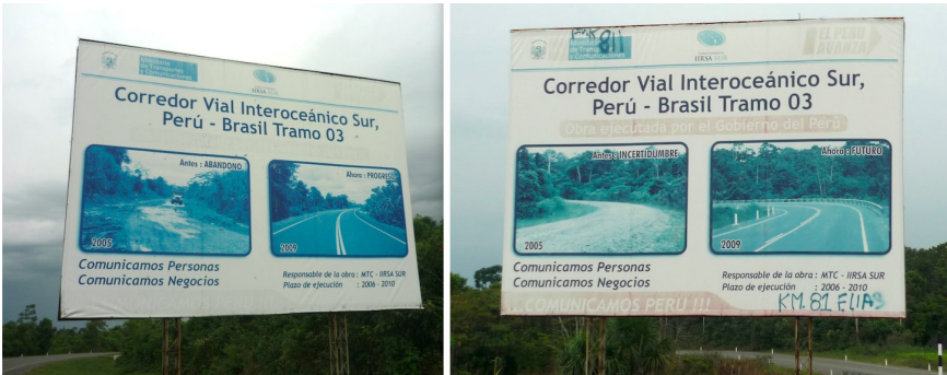
Figure 4. Road signs. Before and After: Abandoned / Progress; Uncertainty / Future.