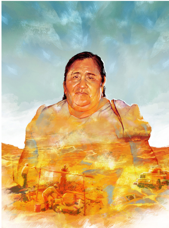
Figure 9. “The Gold Queen.” Image by Marcelo Perez, reprinted with permission.

The practice of Pacha mamaman jaywarikuy in Quechua is “payment to the earth” ritualizing gratitude or a request for favor. Seekers might offer coca leaves, corn, the sacrifice of a sheep or llama. But other scenarios exist. As gold miners move through the rain forest, they dig new pits, erect new mining camps, and the toxic quicksilver utilized to amalgamate gold particles leaches into the forest floor, killing root systems. When the soil collapses, burying the miners in the pits, their deaths can represent payment to the earth, in exchange for gold. The Pachamama “attacks” and the mines fight back, “eating” the miners (Nash 1979). This is another twist of relations that equate mines and women for exploitation.