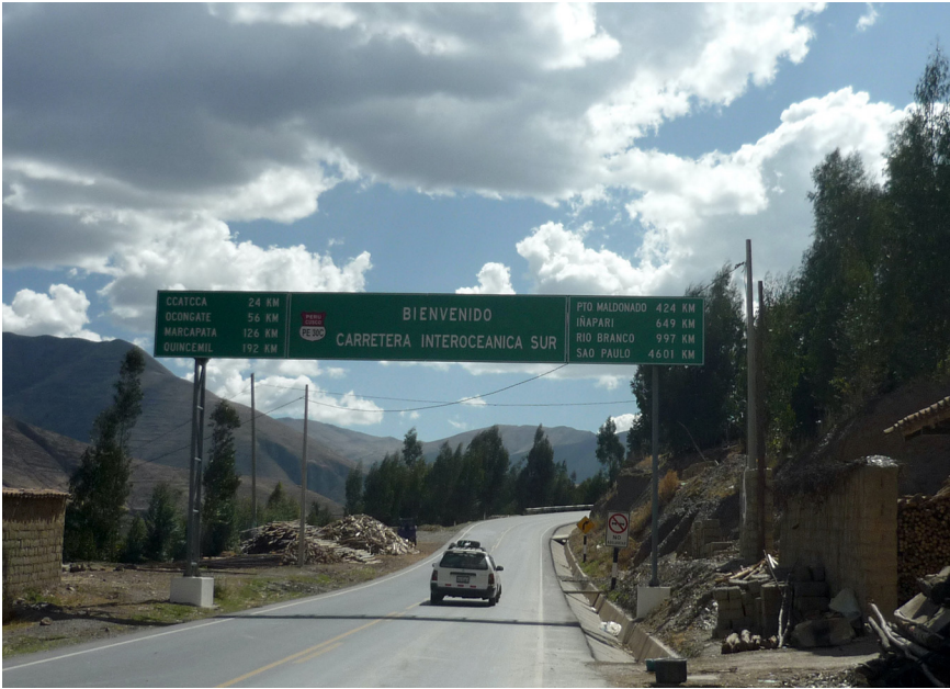
Figure 3. Welcome to the Southern Interoceanic Highway.