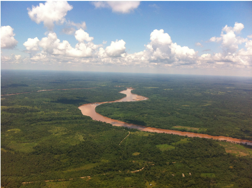
Figure 10. The Madre de Dios River.