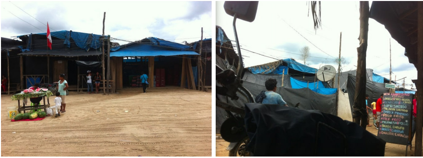
Figure 8. The Streets of an illegal Mining Town.