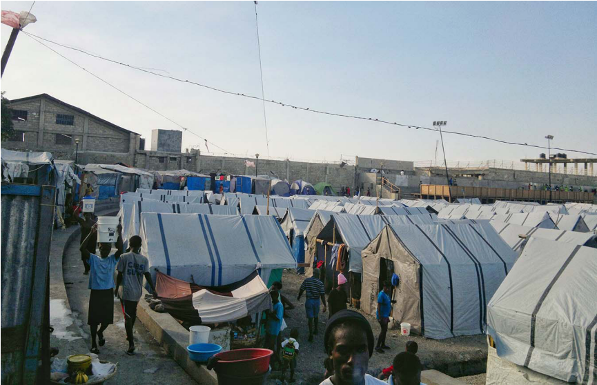
Figure 1. Refugee camp after the earthquake. Bel Air, Port-au-Prince, May 2010.

The earthquake dramatically affected relations between persons and houses. At least 250,000 people died, while thousands more were mutilated and injured, leaving an immeasurable trail of orphaned children, homeless families, and devastated infrastructure. It is estimated that more than 40 percent of the houses in some central districts of Port-au-Prince were destroyed or seriously damaged. At least 300,000 people fled the city, most of them heading to the countryside. Many left for the Dominican Republic and other destinations that compose Haiti's diasporic geography: traditionally North America and France, and now also South America. 2