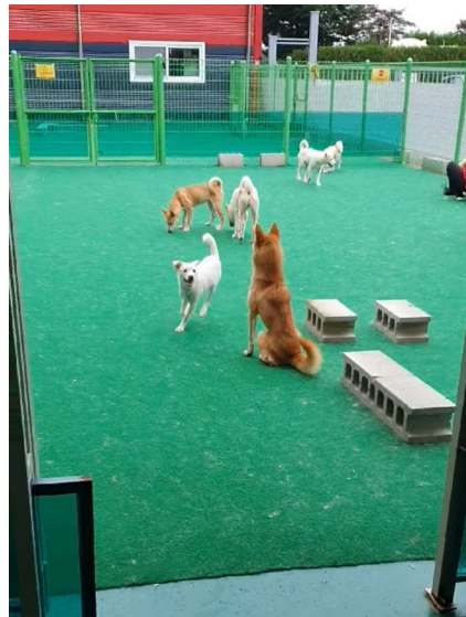
Figure 3 (left). Staff holding a dog in the Gisan-Myun shelter. Photo by EuyRyung Jun. Figure 4 (right). Dogs having their exercise time. Photo by EuyRyung Jun.

If the stories of Jeong Youn and Bora show the power of loss as “generative” of new relationships in that “absence is always potential presence” (Parreñas 2018, 109), the new spaces of connectivity are not only cohabited but also significantly co-molded by the nonhuman other. While Yujin used the word mother love to describe the inborn nature of women inscribed in their bodies, it was often the dogs