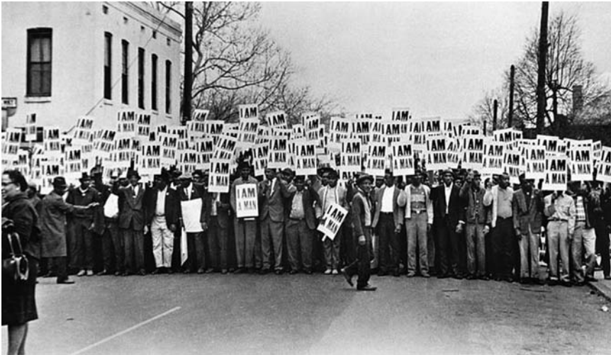
Figure 3. Becoming man. (Photo by Ernest C. Withers, I Am A Man, Sanitation Workers Strike, Memphis, Tennessee, March 28, 1968 )

These are becomings, all: a lesbian becoming Indian, a black man becoming Man, a woman becoming animal. But putting it this way, there are at least two differences between the first two and the last one. The first two begin with a movement from the particular (molecular) to the general (molar), while the last one begins with a movement from the general-particular (human—but still only woman) to the particular. The first two, in other words, are majoritarian, the last one minoritarian. This first difference can probably explain the second, which