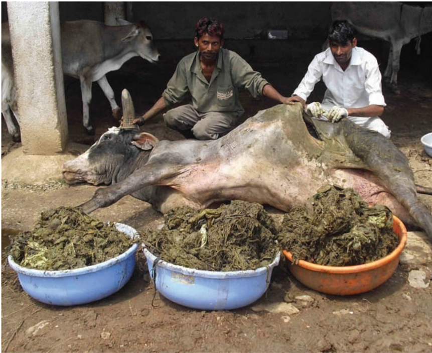
Figure 1. Death by rubbish.

just knowing that they were in the cabinet served a purpose. They would never let me stop.” She then told me about her illicit visits to the Idgah slaughterhouse in New Delhi, whose horrors she filmed and later had shown on the state-owned broadcast service, Doordarshan (an effort by the government, no doubt, to whip up anti-Muslim sentiment under the guise of compassion). The Idgah slaughterhouse has a capacity to process 2,500 animals per day for meat, leather, and by-products, but instead it butchers upward of 13,000 animals daily, around 3,000 buffaloes and 10,000 goats. 15 The animals are brought in from miles around the city, thrown from the trucks into heaps by their limbs, most with their legs already broken and some crushed to death from the journey. Boys and men begin the process of hacking and skinning the animals with rusty knives, the butchers barefoot and shin-deep in blood and shit. There are few sights more heart-breaking—or for those less sentimental than I, more ironic—than of sickly cows eating from the nearly one thousand pounds of cattle excrement, body parts, and clotted blood that the Idgah slaughterhouse dumps at a nearby landfill, a playground for kite-flying slum children, every day.