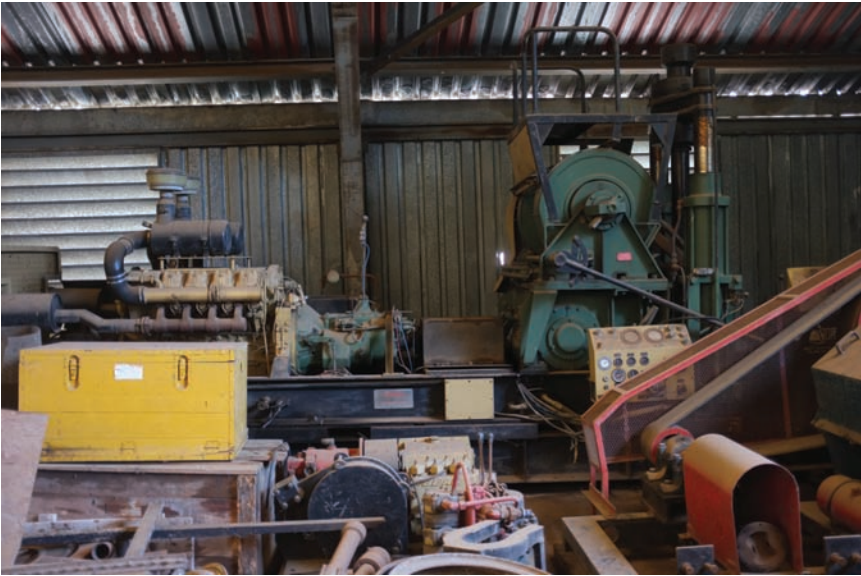
Figure 3. Hellinger's drilling equipment, which is being stored in a warehouse in São Tomé.

As an observation of potentiality, speculation offers a mode of participation in the opportunities that obscured matter portends. It goes along with a distinctive temporal disposition that creatively contemplates possibilities, while excluding others, temporarily suspending a need for certitude in the desire for disproportionate gain. In STP, speculation about future resources generated fresh alliances between public and private actors. From Chamiço's proposal to salvage an ailing colonial territory to the wildcatter Hellinger's ambitious venture, which appealed to cash-strapped officials unversed in either petroleum geology or global markets, different expectations readily converged on an idea of oil and its enabling capacities, both collective and individual. In the face of mounting debt, oil has promised to give a recognizable, sovereign shape to a weak postcolonial state struggling to fulfill its functions. However, the developmentalist vision of oil offers only a deceptive alternative to other, increasingly prominent types of speculative planning, such as the financial speculations of public deficits that have restructured state-society relations in India (Bear 2011). Oil provides a powerful but risky form of economic integration, marred by the disjunctive temporalities of state, science, geology, and markets. It ties collective hopes to the "ethics of probability" of corporate actors (Appadurai 2013, 295), whose capacity to tolerate market