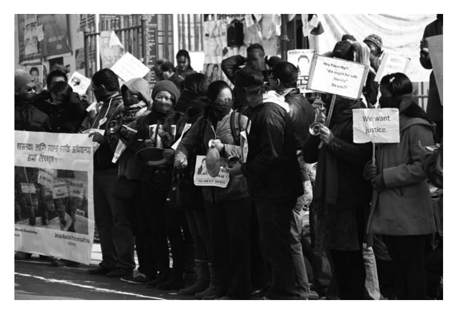
Figure 9. Participants in Occupy Baluwatar tapping plates during an otherwise silent protest.

The use of pots, pans, and metal plates to create the noise of protest is a global phenomenon, used in Argentina (where the practice is said to have originated) and other parts of South America, Quebec, and Turkey. Jonathan Sterne and Natalie Zemon Davis (2012) link the percussive banging on pots and pans in the 2012 Quebec protests to the charivari protests in early modern and modern France, when noisy demonstrations "call[ed] attention to a breach of community standards in the village or neighborhood." Here protesters turn everyday domestic items into the weapons of protest, effectively bringing the home into the public. Besides, drumming out beats together on pots and pans is also just plain fun.