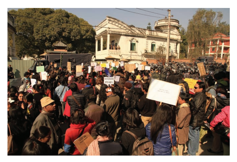
Figure 7. Occupy Baluwatar, in front of Nepal Rastra Bank.

Singh on a public bus and subsequent anti-rape protests in Delhi had captured global attention. Like many other global movements, the Baluwatar protest campaign began on Facebook and Twitter as enraged activists saw little government response.<sup>18</sup> They created a petition for the prime minister, first posted on Facebook, and then on other social media they agreed to meet close to his residence for others to sign the petition. They continued to meet near the prime minister's residence every morning from 9 to 11 a.m. beginning on December 28, 2012, for a continuous 107 days in hopes of delivering the petition in person.