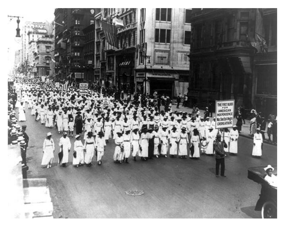
Figure 5. Silent protest against police mistreatment by African Americans in New York City, 1917.

When performed by a large group in public, silence often emphasizes death and respectful mourning (Schwartz 2011, 617). Marié Abe (2016, 247) convinc-