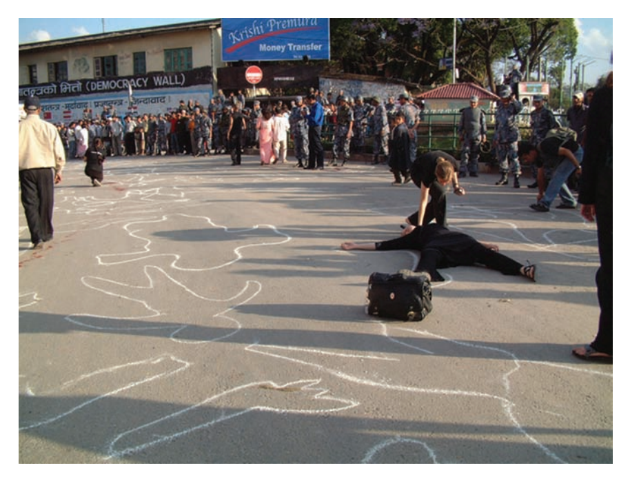
Figure 3. Chalk bodies and Democracy Wall.

on the street. Contrary to other protests, this one was not interrupted by police vans and arrests. Uprety (2004) reported a police officer commenting that "if all of the political protests were this peaceful, [police] wouldn't have to fire tear gas and plastic bullets." Perhaps because A Happening was understood as art that made no specific political demands, police and army personnel complied with Ashmina's request not to carry out arrests.