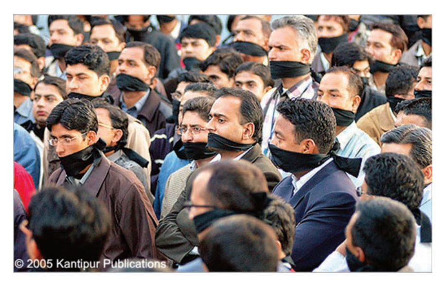
Figure 4. Silent protest against government takeover of media, October 2005.

with black scarves tied around their faces.<sup>13</sup> Journalists and media personnel staged a similar protest fifteen years later after the government had raided an FM radio station, dramatically representing the condition of silence they found themselves in. Even the nonauditory media of newspapers invoked a metaphorical silence. In March 1990, a blank editorial page in the weekly Nepali Āwāj (Nepali Voice) was appended with a short explanation of its emptiness: "To oppose the arrests of around forty journalists and other professionals from all over the country."