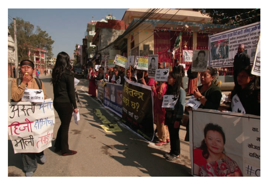
Figure 8. Occupy Baluwatar noise.

range of people from different classes, languages, races, and genders to participate in the infectious banging of pots and pans to protest a law that banned large gatherings (Sterne and Davis 2012). Noise always threatens to become polluting, to be read by authorities or those on the street as merely chaotic disturbances that make no sense and need to be brought under regulation.<sup>21</sup>