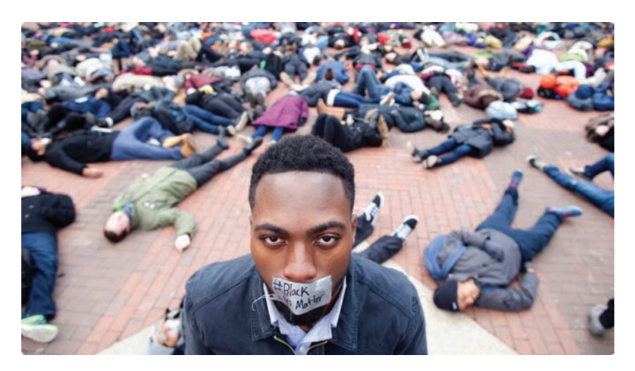
Figure 6. Ashmina's use of voicelessness, coupled with the staging of fallen bodies on the ground, draws on a global repertoire of protest iconography evident in this image of a Black Lives Matter silent protest.

ingly shows that, in the aftermath of the 2011 earthquake in Japan, silence was not a sonic performance of oppression or the alter ego of voicing, but became a "performance of national mourning and social embeddedness." This connection was made literal in Ashmina's happening as performers fell to the ground to feign death while their partners traced their bodies in chalk, mimicking global police imagery of death at the scene of a crime.